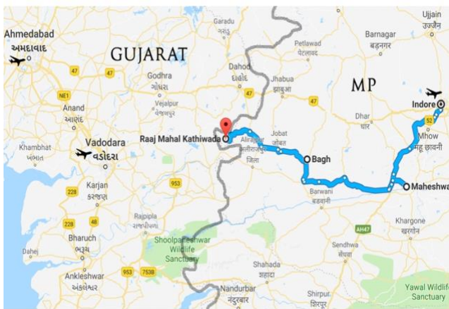
Madhya Pradesh Circuit